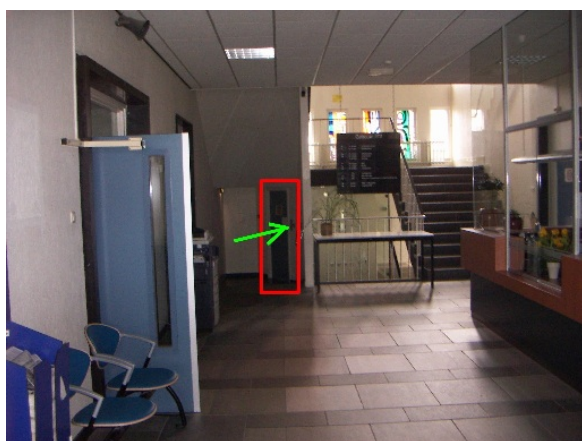
(a) The hall of the lecture rooms of the Faculty of Medicine.

As visible from Figure 2(b) the bell that you need to ring to gain access to the EEGlab is the second starting from the top.