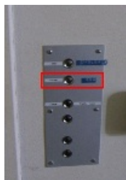
(b) Doorbells panel

Figure 2: The red rectangle outlines the door to the stair-case that brings to the basement where the EEGlab is sited. The green arrow points to the location of the bell. In the left figure the EEGlab's bell is outlined in red, and can be easily identified through the label at the right-side of the bell.