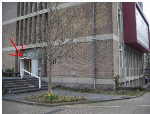
(b) Entrance to the building

Figure 1: The the red rectangle outlines the building hosting the NIC, whereas the green arrow indexes the gate to access the building. The red arrow points to the entrance to the building.